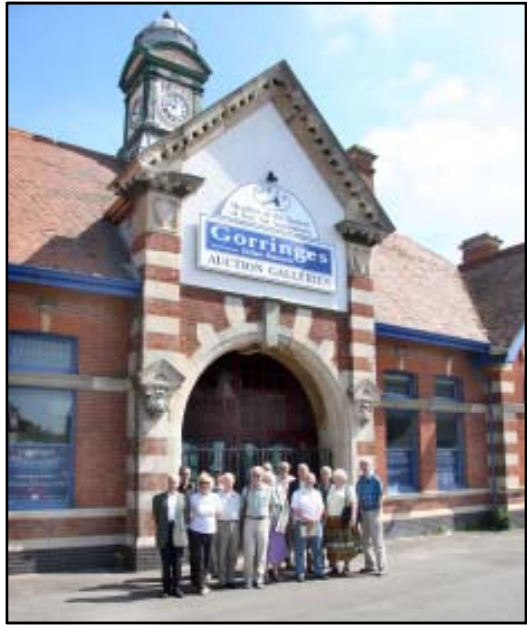
Former Bexhill West Station on the Seaside Tour ( Malcolm Dawes )