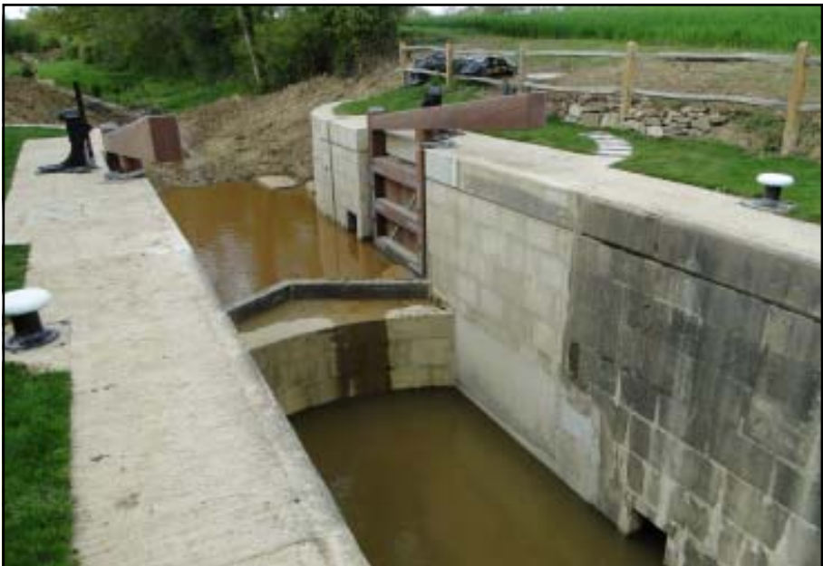
The restored Devil's Hole Lock on the Wey and Arun Canal, Loxwood. Note the lighter coloured stone of the extended lock. ( Martin Snow )