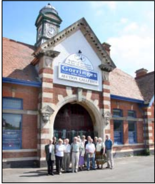
Former Bexhill West Station on the Seaside Tour ( Malcolm Dawes )