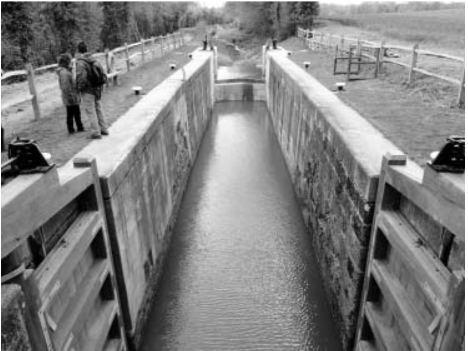
Devil's Hole Lock, newly restored by the Wey and Arun Canal Trust.

For more information refer to the Trust's website - www.weyandarun.co.uk