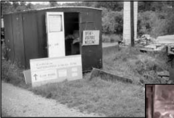
Coultershaw Beam Pump – First public open day. First amateurish efforts at informing and directing the public!