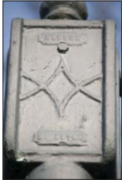
BLEECO cast iron lamp post and control box (John Blackwell)