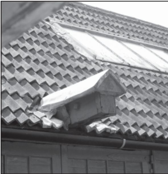
Triple angle tiles on former printing works in St. John’s Street Chichester

other area of England where single lap tiles are found is in the area around Bridgwater in Somerset. The reason may be that the marshy area of the Somerset Levels favoured the use of reed thatching and inhibited the use of plain tiles in the same way as in East Anglia. In the middle of the 19 th century Bridgwater became the largest producer of tiles in the country and they produced many different patterns of the single lap tiles and exported to many parts of the country and these including pantiles and Patent single and double Roman tiles. Another pattern was described as “Triple Angle” and in section was a series of zigzags. I was quite surprised to find a roof covered with these tiles on the former printing works in St. John’s Street, Chichester. How they came to be use there is a mystery. I also noticed some on TV in a recent episode of Lark Rise to Candleford which was, presumably, filmed at Lacock, which is in the distribution area for Bridgwater tiles.