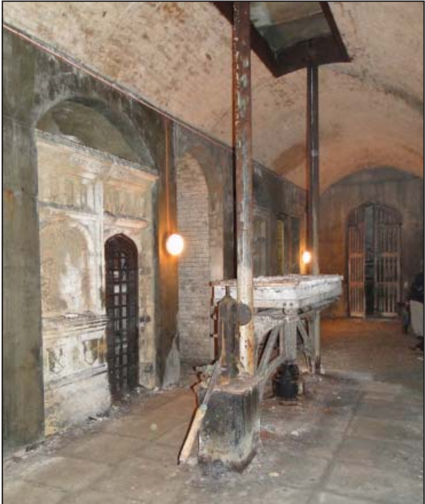
1841 Catafalque at West Norwood Catacombs by Bramah & Robinson