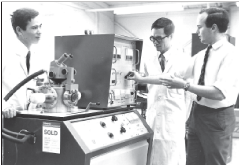
The Edwards IBMA1 Ion Beam Machining Apparatus, designed and manufactured in Hampden Park in the 1970s. This uses argon gas to provide high tension ion beams that impinge on rotating samples within the vacuum system in order to thin them down for inspection in a transmission electron microscope.

It is understood that Crawley Museum are considering setting up a special temporary exhibition in the near future covering the history of the industrial area of Crawley which would include the companies mentioned above.