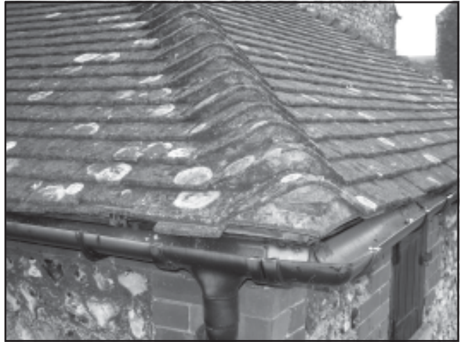
Plain tiles with bonnet hips

and a 2½” lap. Because the tiles are not even there is a tendency for rain to drive up, so that plain tiles are normally laid to a pitch of not less than 40°. Early tiles were holed and hung from battens with oak pegs, but later they were nibbed and nailed every fourth or fifth course. Because each tile is comparatively small and flat, they can be easily cut and they are admirably suited to complicated roof shapes with hips, valleys and dormer. One very attractive feature of plain tiled roofs is the treatment at hips using arris tiles or bonnet hip tiles. The latter are shaped like the old fashioned poke bonnet and are bedded in mortar. Prior to the introduction of tiling most roofs were covered with thatch, in the South-east this being derived from long straw. This is an expensive product and not particularly durable and when plain tiles became available in the 14 th century these began to usurp thatch as the preferred option. Due to the multiple thicknesses and steep pitch of plain tiled roofs their weight was considerable.