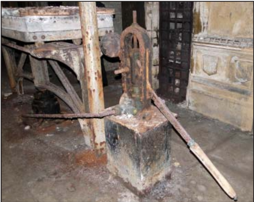
Just a little TLC required ? The Bramah catafalque hydraulic pump (Martin Snow)